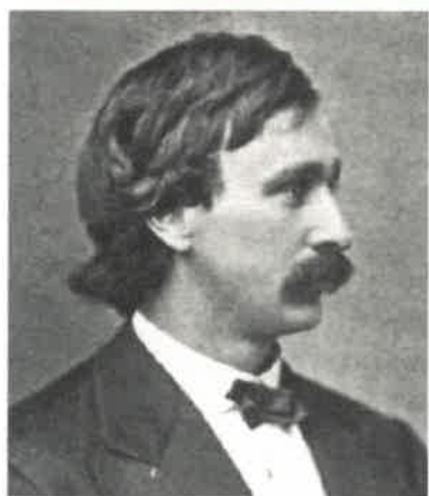
William Henry Harrison Murray, 1871 (From Adirondack Murray , a biographical appreciation by Harry V. Radford, 1906)

One hundred fifty years ago, thousands of middle-class urbanites from Boston and New York City abandoned the comforts of their homes, and rushed to the Adirondacks, an unknown, northern wilderness, believing they would find great restorative and even curative powers.